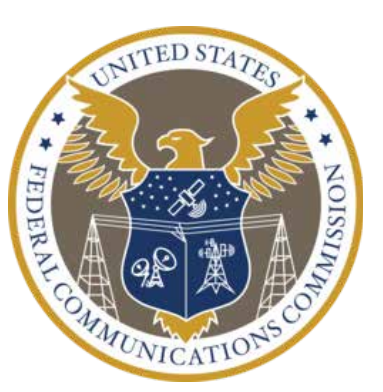
The new FCC seal

"The FCC continues to balance its efforts to be accessible to the public with the need for heightened security and health and safety measures and encourages the use of the Commission's Electronic Comment Filing System (ECFS) to facilitate the filing of applications and other documents when possible," the FCC said in an October 15 Public Notice.